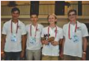
Norwegian Delegation (Students)