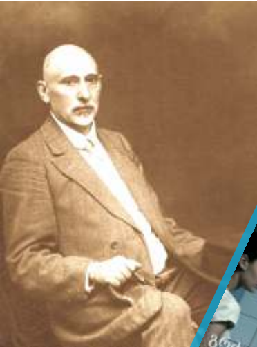
In photos Tbilisi and Batumi, Georgia

Ekvtime Takaishvili was a Georgian historian, archaeologist and public benefactor. In 1917, he was among the founders and professors of the Tbilisi State University. He lost his tenure both in the parliament and at the TSU in 1921, when the Bolshevik Russia's 11th Red Army put an end to Georgia's independence. He followed the Georgian government in their French exile, taking the Georgian national treasury – numerous precious pieces of Georgian material culture - with him to Europe. The treasury contained into 39 immense boxes, were shipped to Marseille and placed in a bank depository. Subsequently this precious cargo was transferred to one of the banks in Paris. Although the treasury was officially the property of the Georgian government-in-exile, it was actually Ekvtime Takaishvili who supervised this huge collection. Despite numerous attempts by various European museums to purchase portions of this treasury, and extreme economic hardship, Takaishvili never sold a single piece of the priceless collection to live on and guarded it.