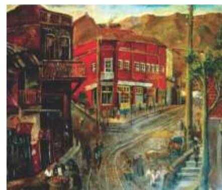
Elene Akhvlediani, Tbilisi

Elene Akhvlediani was a 20th-century Georgian female painter, graphic artist, and theater decorator. Akhvlediani is famous for her depictions of Georgian towns, for her illustrations, for the works of famous Georgian writers and for designing plays in the Marjanishvili Theater in Tbilisi, Georgia.